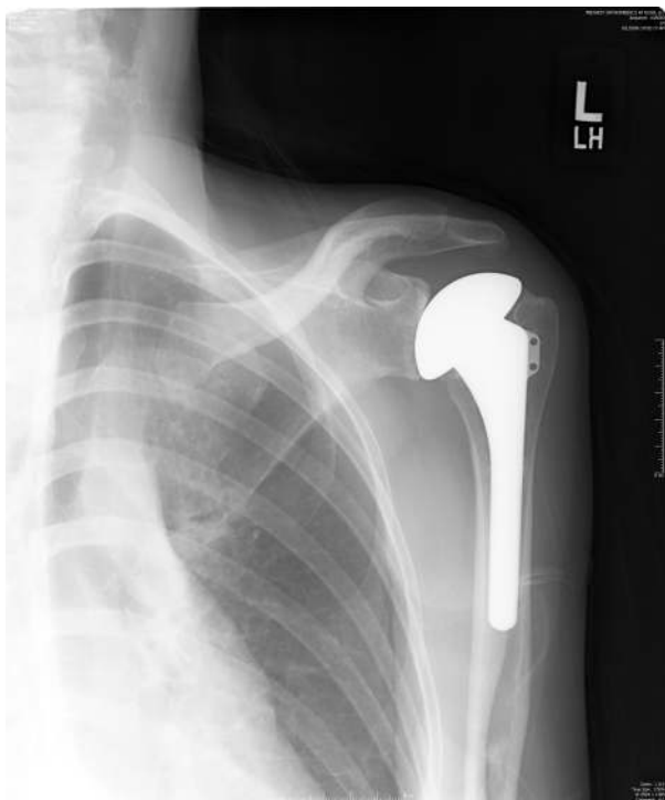
Figure 2 Anteroposterior radiograph of a patient after hemiarthroplasty.