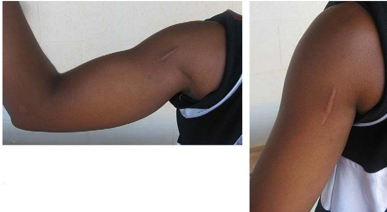
Figure 2 Clinical photographs showing post-operative scar from open tenodesis and resolution of cosmetic deformity.

windmill, remains incompletely understood. However, because of the uncertainty regarding the exact role of the LHB in these elite athletes and the potential adverse impact on throwing ability, there has been a general reluctance to treat biceps pathology with tenotomy or tenodesis.