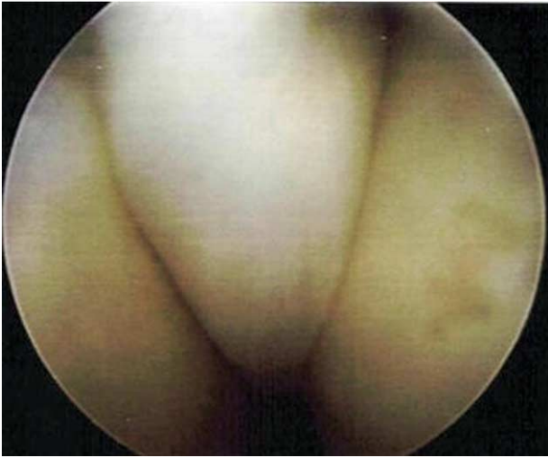
FIGURE 3. This is an arthroscopic active compression test performed in a patient with clicking and mechanical symptoms, but without pain. Subluxation of the tendon within the joint is evident, but because the clicking was not painful no intervention was performed.

commonly accepted that the biceps tendon can play an important role in shoulder pathology and serve as a major pain generator within the shoulder.